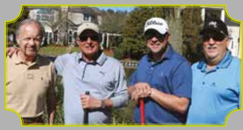
A day on the greens brings smiles to golfers who helped the United Way and area non-profit organizations by participating in Norco's Annual United Way Golf Tournament.

The early morning was one of those cold, damp dreary days in Louisiana. But that didn't stop more than 150 golfers from hitting the Pelican Point Golf Course greens to raise money for the United Way of St. Charles in the Shell Norco United Way Golf Tournament this November. By the time the sun came out, the golfers were in full swing with warm hearts fueling a great cause.