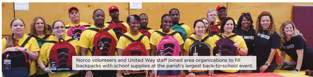
Norco volunteers and United Way staff joined area organizations to fill backpacks with school supplies at the parish's largest back-to-school event.