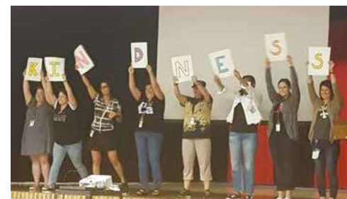
Norco Elementary School Kindness Project