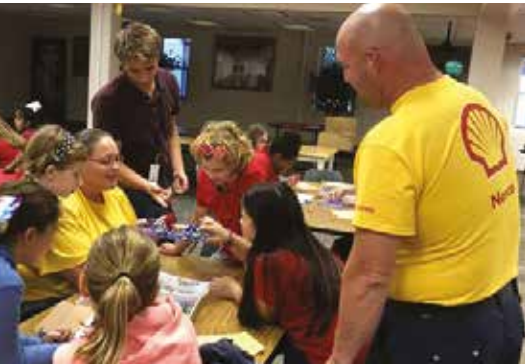
Norco volunteers and Destrehan Robotics team members assist area kids work on scientific crafts at STEM camp.

at Destrehan High School in July. The hands-on experience introduced students from Norco's Partner in Education schools, Norco Elementary, Harry Hurst Middle School and Destrehan High School to robotics, coding, engineering, computer science, and more.