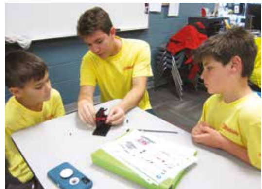
Easy, fun and educational – area youngsters learn basic principles from the Destrehan Robotics team members who served as counselors during the summer camp.