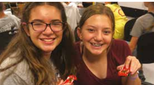
Science is Fun!