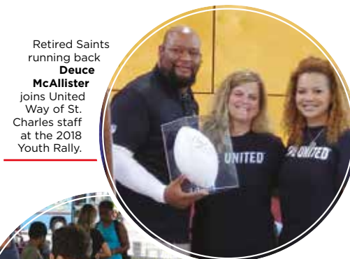
Retired Saints running back Deuce McAllister joins United Way of St. Charles staff at the 2018 Youth Rally.