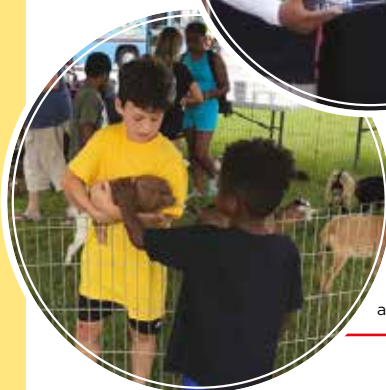
A petting zoo was one of several activities for area kids at a Youth Rally to kick off the start of a new academic year.