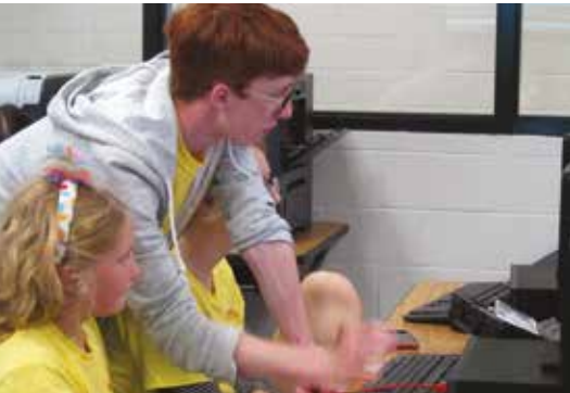
Destrehan student counselors were on hand this summer to demonstrate procedures to STEM campers.