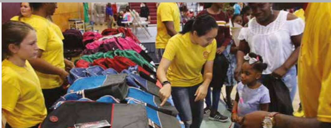
Norco volunteers help St. Charles Parish students get ready for the first day of school with a new backpack.

In addition to fun, motivational keynote speeches, giveaways, and schools supplies, families were given the opportunity to learn about available community services. Representatives from the St. Charles Women's Club, Child Advocacy Services, St. Charles Department of Community Services and various other organizations were on site to share their program and resources. The Bloodmobile and the St. Charles Parish Fire Department were also on site.