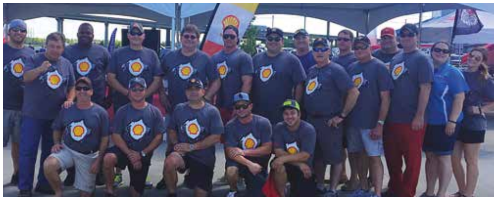
Competitors be prepared. Shell Norco chefs are bringing their secret recipes for preparing gumbo and jambalaya to the United Way cook-off. It's possible the cooks will share a few of those secrets with you at this year's United Way battle.