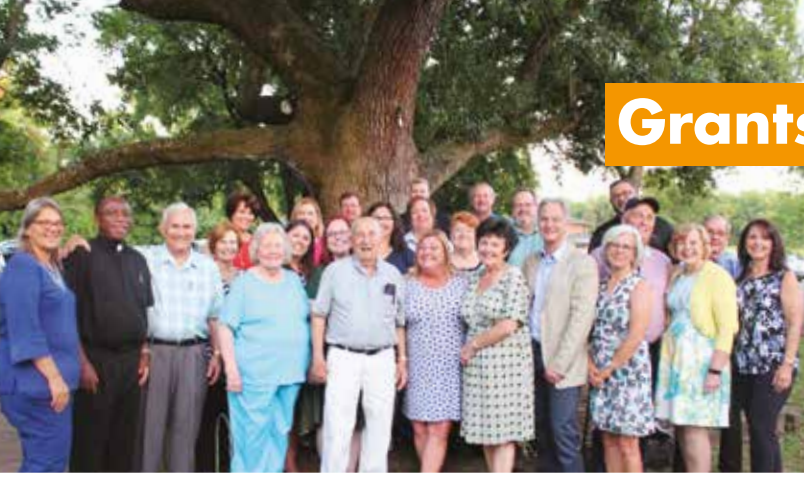
Norco community members are happy. Pictured here are representatives of the non-profit organizations who received NCF and NEDF grants.