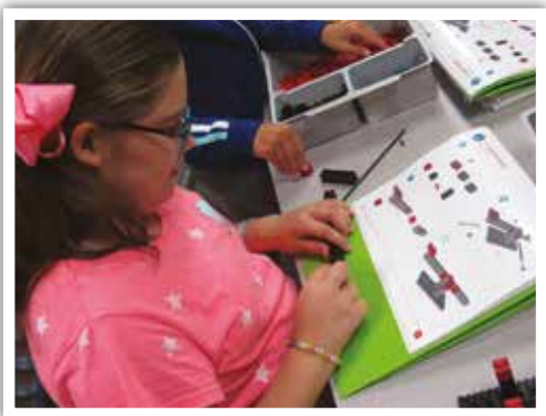
A hands-on approach to scientific principles is the foundation for learning at STEM Camp.

The five-day camp introduced students to robotics, coding, basic electricity, automation and more, utilizing programs such as Ozobots, littleBits, Vex, Makey Makey, Scratch Coding and Arduino.