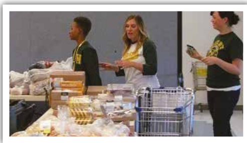
Volunteers at Matthew 25:35 Food Pantry prepare food packages for community members in need.