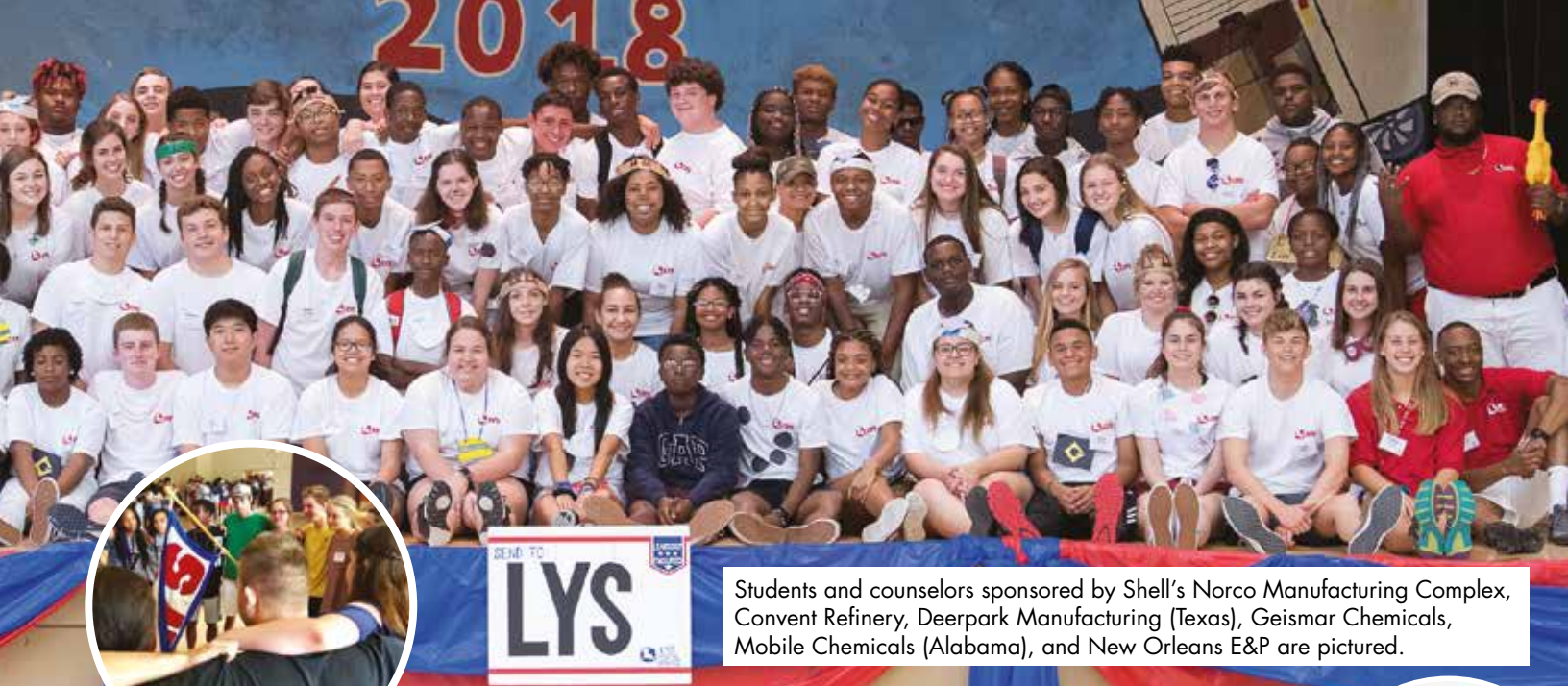
Students and counselors sponsored by Shell's Norco Manufacturing Complex, Convent Refinery, Deerpark Manufacturing (Texas), Geismar Chemicals, Mobile Chemicals (Alabama), and New Orleans E&P are pictured.

After one last time singing the theme song "No Man is an Island" everyone shared some bittersweet goodbyes as LYS 2018 came to a close.