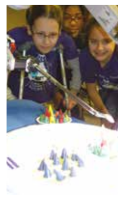
Girl Scouts participate in a Lego Robotics competition.