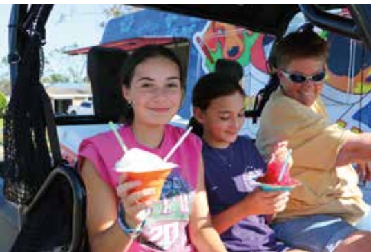
Nothing better than a snowball to beat the heat - especially when you have no electricity.