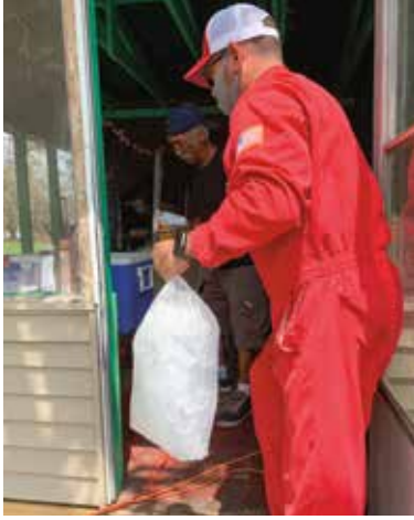
Ice and other essentials were delivered.