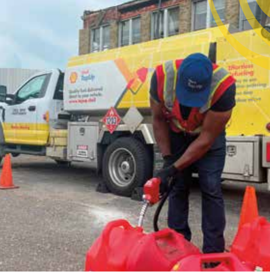
When commercial pumps were down, Norco employees and contractors were able to fill up on-site for several days following Hurricane Ida.