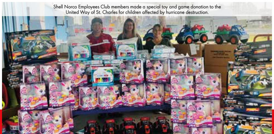
Shell Norco Employees Club members made a special toy and game donation to the United Way of St. Charles for children affected by hurricane destruction.