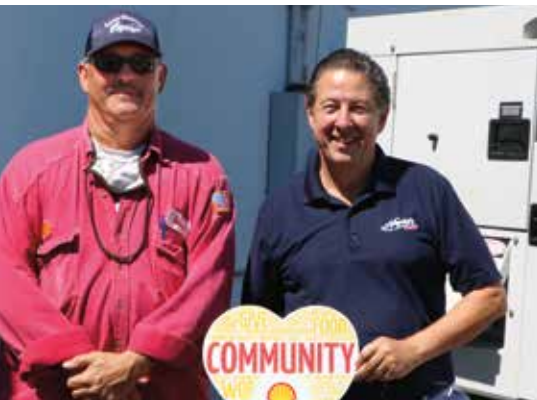
Haydel's Furniture was one of several Norco businesses to benefit from a Norco-supplied generator and/or fuel within days after Ida.