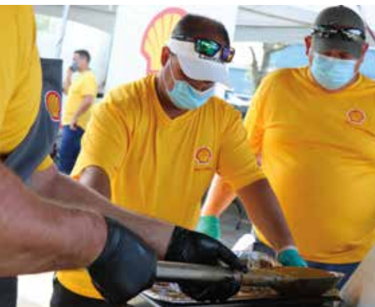
Shell volunteers from around Louisiana helped to serve 1,800 hot meals to Norco residents recovering from Hurricane Ida.