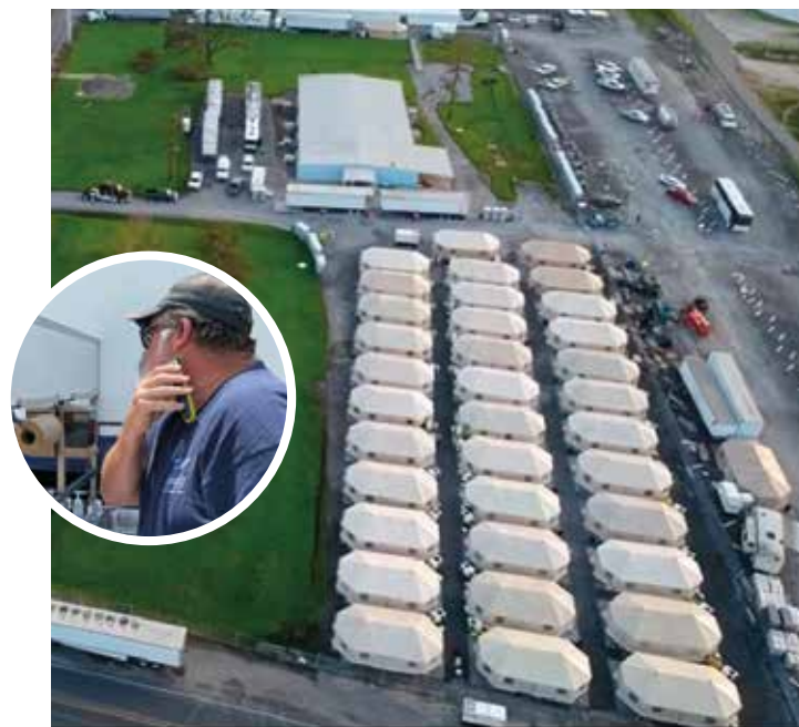
A basecamp for Norco employees and utility workers in the aftermath of Ida provided a good place for a shower and a shave.

A full report of the Norco's air-monitoring statistics is available at www.norco-air.info .