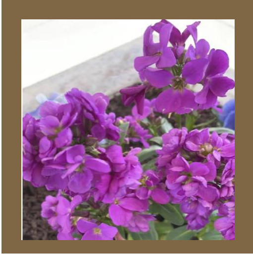
Scientific name: Matthiola incana

These plants are known for their colorful flowers that bloom in clusters on top of a straight green stalk with lots of leaves at the bottom. This plant originated in Europe.