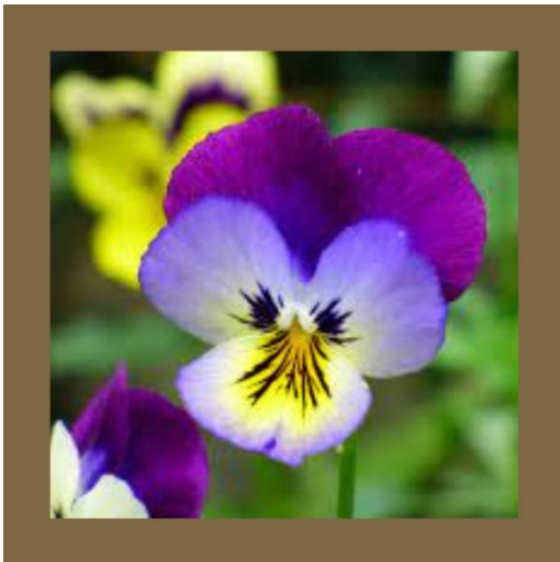
Scientific name: Viola wittrockiana

This plant is a common European wildflower that is used for decoration. The flowers are usually purple and yellow but can be many other colors as well. They usually have five petals atop a small stalk.