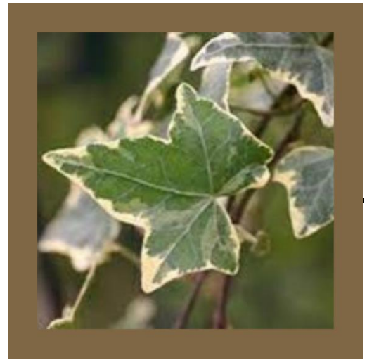
Scientific name: Hedera helix 'gold child'

This woody vine often crawls across the ground or up walls for decoration. It grows very fast and is considered invasive in many places if it escapes where it has been purposefully planted. The leaves have three points. English Ivy is invasive to Indiana.